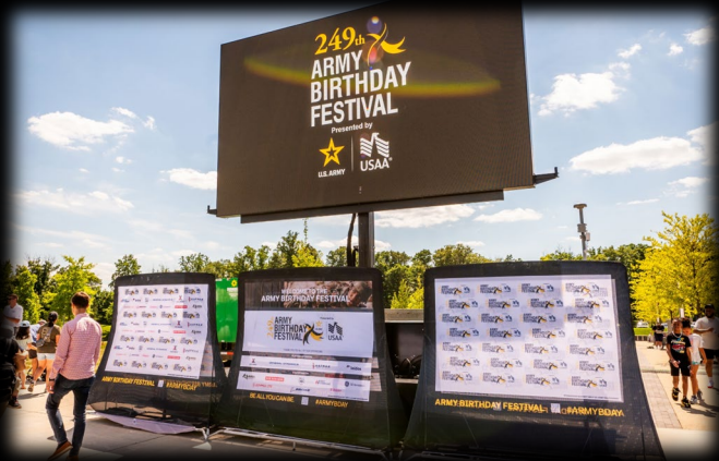
Step N Repeat