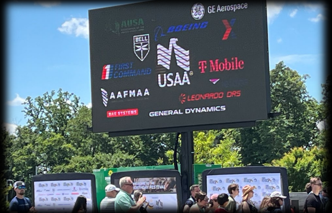
Thank You Sponsor Video