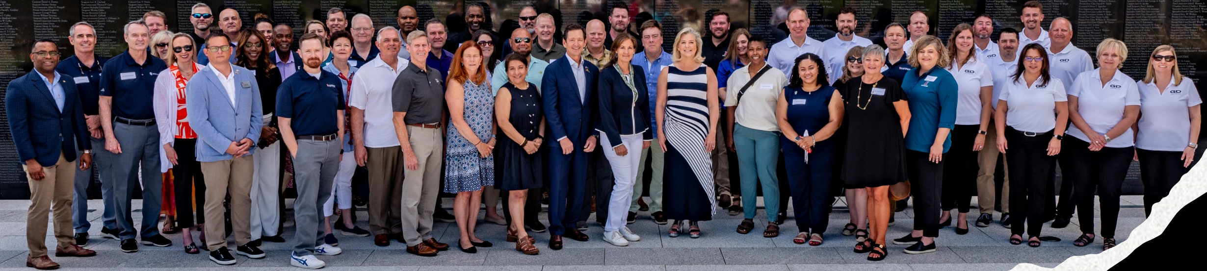
2024 Sponsor Photo with the 25 th Secretary of the Army, Honorable Christine Wormuth