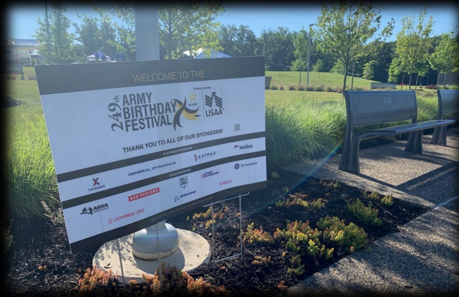
Thank You Sponsor Sign